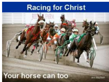
Racing for Christ