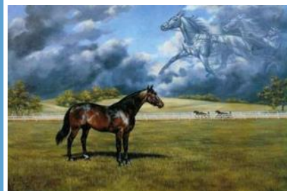
Rambling Willie Remembers