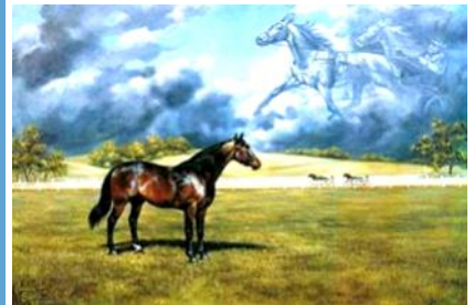
Rambling Willie Remembers