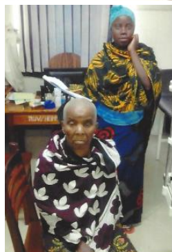
These women were blind and can now see.