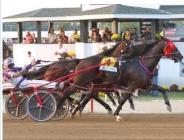
2018 Jug Photo Finish