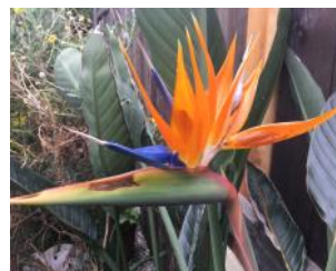
Bird of Paradise