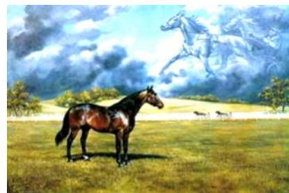
Rambling Willie Remembers

These lovely 5 x 7 Rambling Willie cards are packaged in sets of 10 cards. They are blank inside.