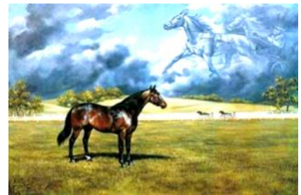
Rambling Willie Remembers

These lovely 5 x 7 Rambling Willie cards are packaged in sets of 10 cards. They are blank inside.