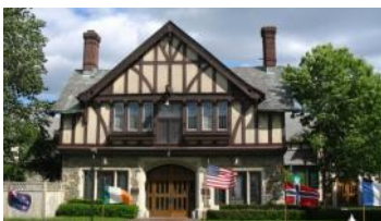
Harness Racing Museum and Hall of Fame, Goshen, NY