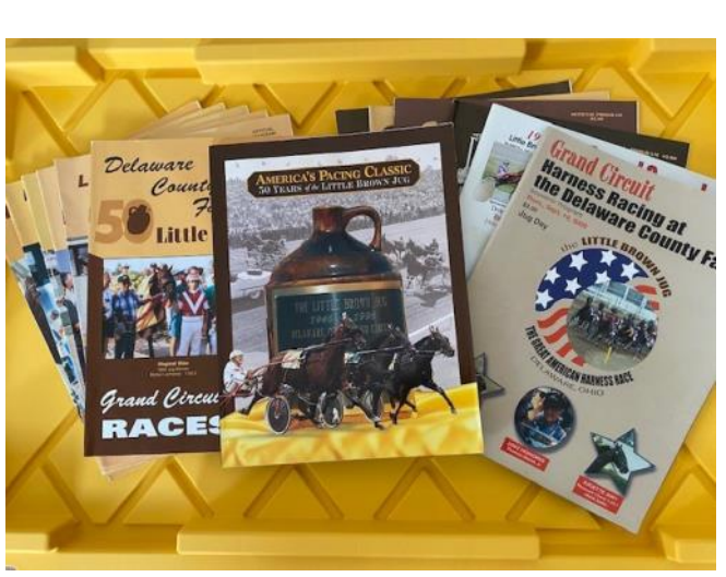
Little Brown Jug Program Fundraiser

drift off to sleep in His arms. In between, He feeds us with all manner of fruit, vegetables, grains, meat and refreshing water from His heavenly well. What a caring and loving God we have in Him. Slow to chide and quick to bless. Those that say there is no god, let them open their eyes and see. God Bless all.