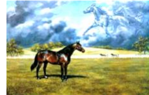
Rambling Willie Remembers

These lovely 5 x 7 Rambling Willie cards are packaged in sets of 10 cards. They are blank inside.