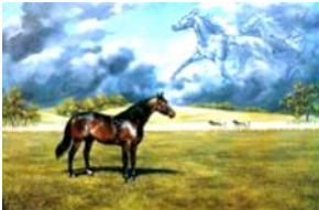
Rambling Willie Remembers

These lovely 5 x 7 Rambling Willie cards are packaged in sets of 10 cards. They are blank inside.