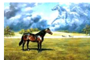
Rambling Willie Remembers

These lovely 5 x 7 Rambling Willie cards are packaged in sets of 10 cards. They are blank inside.