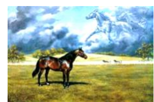
Rambling Willie Remembers

These lovely 5 x 7 Rambling Willie cards are packaged in sets of 10 cards. They are blank inside.