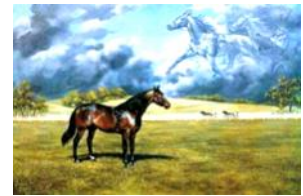
Rambling Willie Remembers

These lovely 5 x 7 Rambling Willie cards are packaged in sets of 10 cards. They are blank inside.