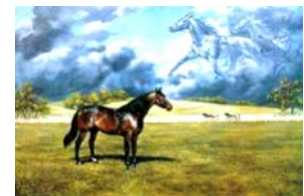
Rambling Willie Remembers

These lovely 5 x 7 Rambling Willie cards are packaged in sets of 10 cards. They are blank inside.