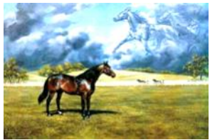
Rambling Willie Remembers

These lovely 5 x 7 Rambling Willie cards are packaged in sets of 10 cards. They are blank inside.