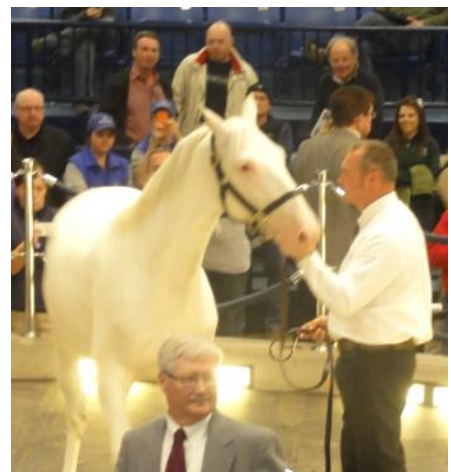
White Bliss in the Harrisburg Sales Ring

Perhaps when we think of the starting gate opening, we can think of heaven's gate opening and Jesus coming on His white horse for us. Let's be ready.