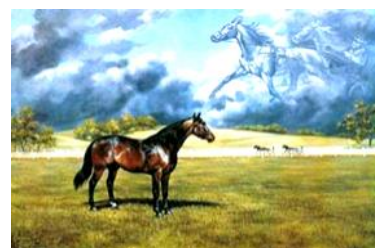
Rambling Willie Remembers

Jack Levine’s books are also available FREE as downloads at: https://www.jackalanlevine.com/ebooks