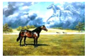
Rambling Willie Remembers