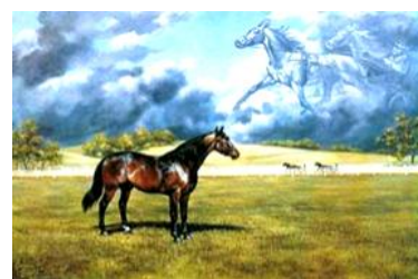
Rambling Willie Remembers